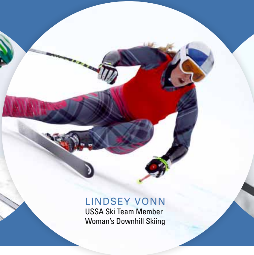
LINDSEY VONN USSA Ski Team Member Woman's Downhill Skiing