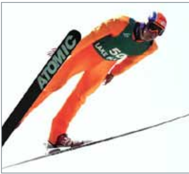
Bill Demong, Vancouver Games Gold Medalist, Nordic Combined Skiing

"I use Shaklee products exclusively as part of my daily routine. I like Shaklee Vitalizer™ because it's in one easy packet. I also take Defend & Resist Complex to help keep my immune system up, especially during all the travel.*"