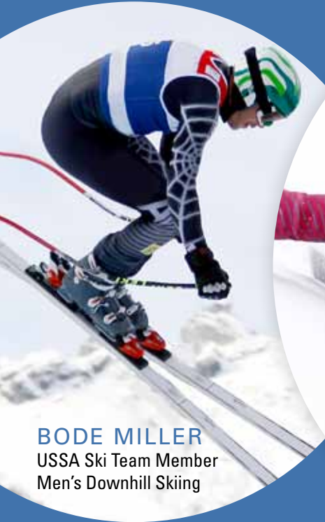
BODE MILLER USSA Ski Team Member Men's Downhill Skiing