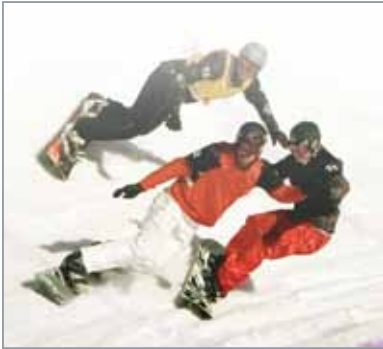
Seth Wescott, Vancouver Games Gold Medalist, Men's Snowboard Cross

"I'm always doing something active, whether it's mountain biking or surfing. It's always good to have something that gives you a little nutritional boost to keep you going."